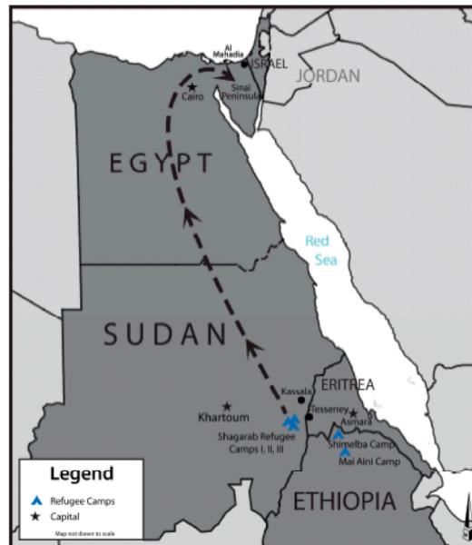
Graph 3: Route from Eritrea to the Sinai 2009–2014

This older route used from 2008–2014 is included because of its relevance in understanding today's practices in trafficking for ransom. The Sinai trafficking route was the first known route in Africa where trafficking for ransom has occurred. At present, the practice of trafficking for ransom has been extended to Sudan, South Sudan and Libya. 23 While the situation in the Sinai has been reasonably well researched, the current situations in Sudan and Libya are little researched and difficult to access.