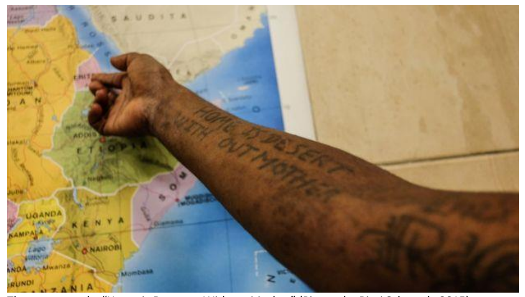
The tattoo reads: "Home is Dessert - Without Mother"

Mothers are venerated as their source of life and creation. Arrival in Europe is a vindication and honour to their mother. It is celebrated with public reverence to their mother and to the church as a contribution to the family and the community. Many wear tattoos of crosses as a sign of their devotion (Schryock, 2015).