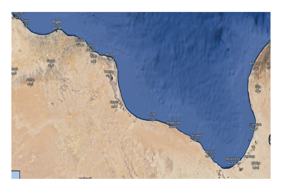
Figure 4.2. Map showing the Libyan cost with Ajdabya in the east, south from Benghazi, Tripoli and Zuvara

In this same report by the United Nations Support Mission in Libya (UNMIL) & the United Nations High Commissioner for Human Rights (OHCHR), the UN expressed concern that 4,000–7,000 migrants are being held in detention centres run by Libya's Department for Combatting Illegal Migration ( Ibid. ).