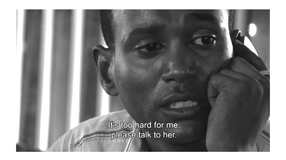
Figure 4.1. Sound of Torture

Thus, the use of ICTs not only results in primary trauma for the relatives, but also in secondary and collective trauma, as families, friends and whole communities are indirectly exposed to the trauma of the hostage. Hence, while ICTs are the perfect means to transcend time and space, they can also intensify and spread trauma.